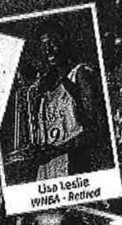
Lisa Leslie WNBA - Retired