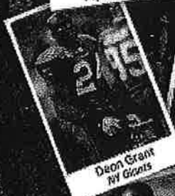
Deon Grant NY Giants