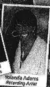
Yolanda Adams Recording Artist