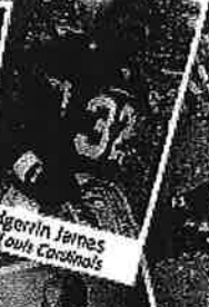
Edgerrin James St. Louis Cardinals